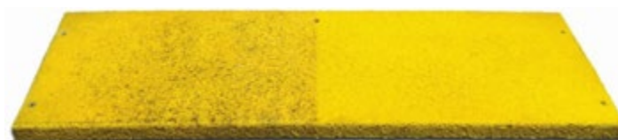
Example showing before and after high pressure cleaning

CAUTION: Do not use mops. The gritted surface will catch and retain fibres. Strong solvents are likewise not recommended.